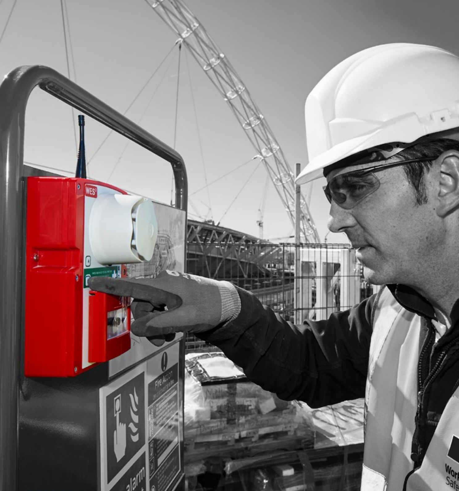
The WES3 range at a glance